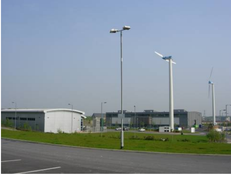
Four units on the Maasvlakte, the Netherlands