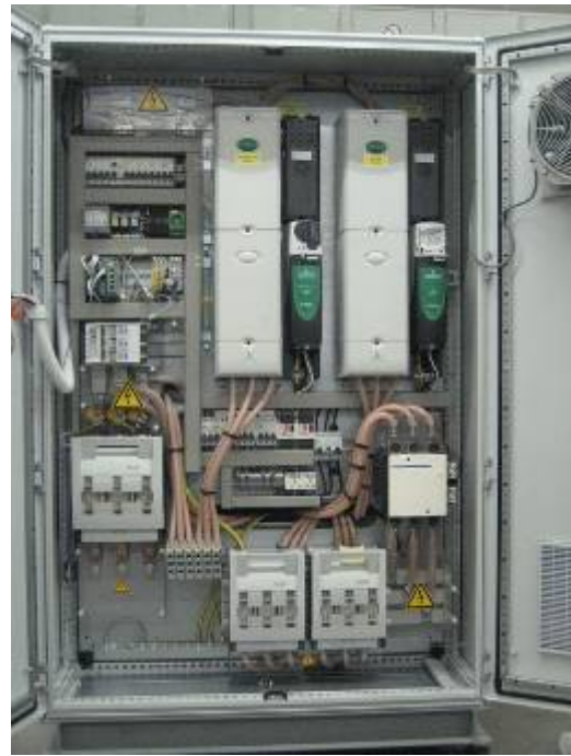
State-of-the-Art IGBT Control Cabinets